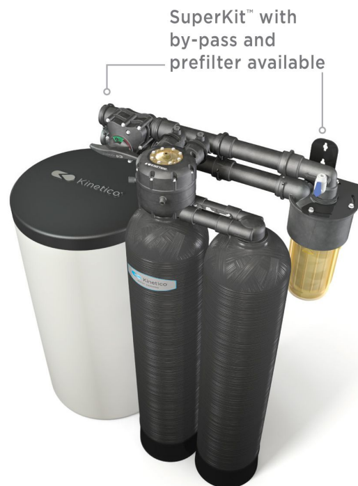
Model Shown: 2060s

Platinum 10 Year Limited Warranty: Enjoy years of dependability and peace of mind with one of the most comprehensive warranties in the industry.